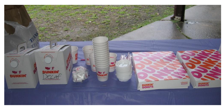
A good start to the day