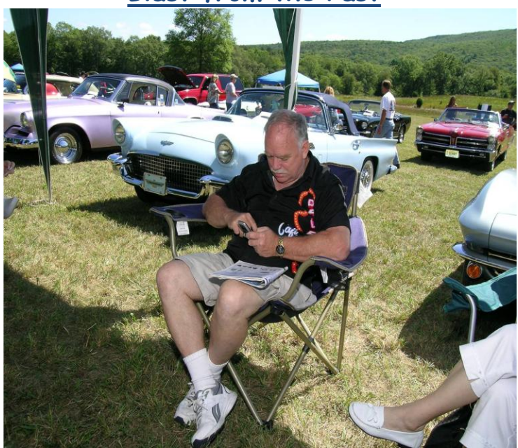
Walpack Inn 2006

PSA-every few days try your jeans on just to make sure they fit. PJ's will have you believe all is well