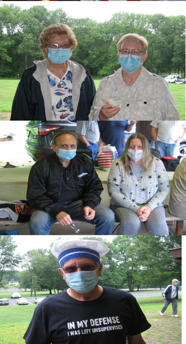
No celebs with Tbirds this month