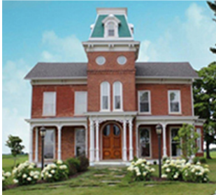
The James E. Bonine House