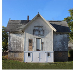
The Bonine Carriage House

I (we) want to help restore these iconic buildings to the beacons of freedom they represent.