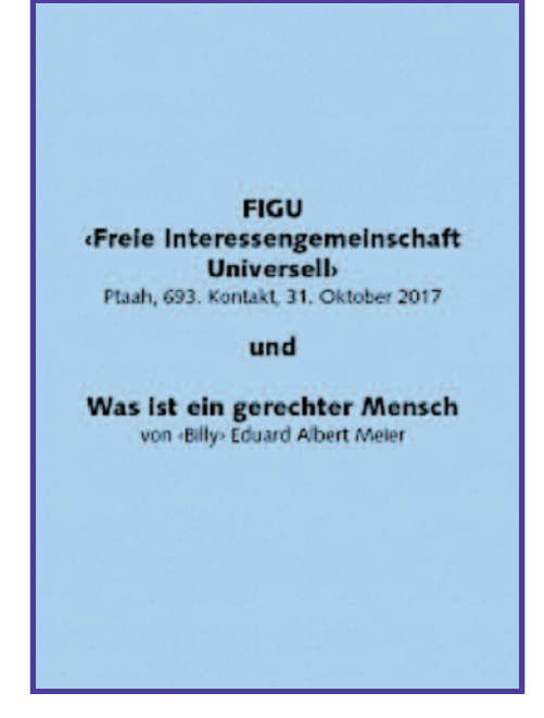
FIGU 'Free Community of Interests Universal'

In its expanded form and is named as 'Free Community of Interests for Border and Spiritual Sciences and Ufology Studies'