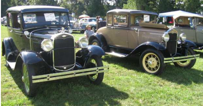
I have a soft spot for Model A's

As a lot of us know, these collars and columns seize from lack of use and they can be tough to loosen if they do.