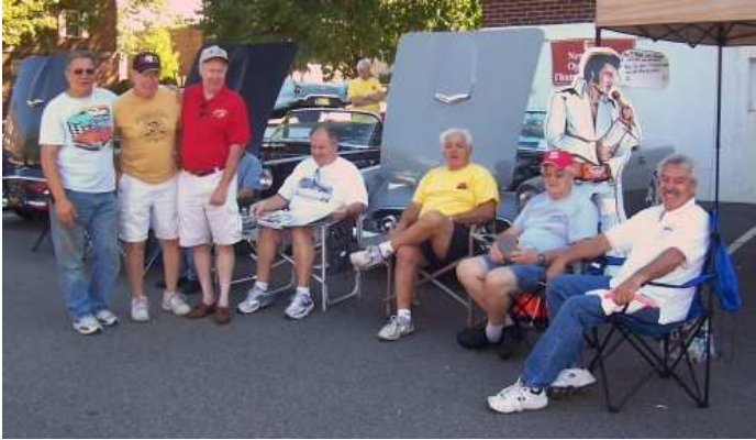
Elvis was there too - straight from Memphis

Many NJORTC members attended this show. Another very nice show on a great day. Over 100 cars made a nice mix.