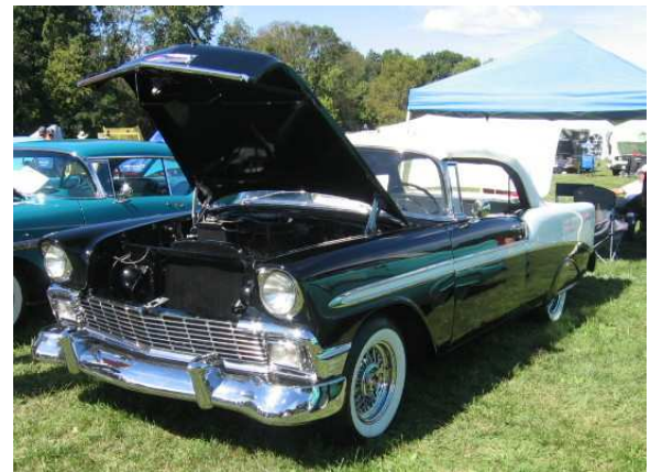
John's other car

If everything seems to be going well, you have obviously overlooked something