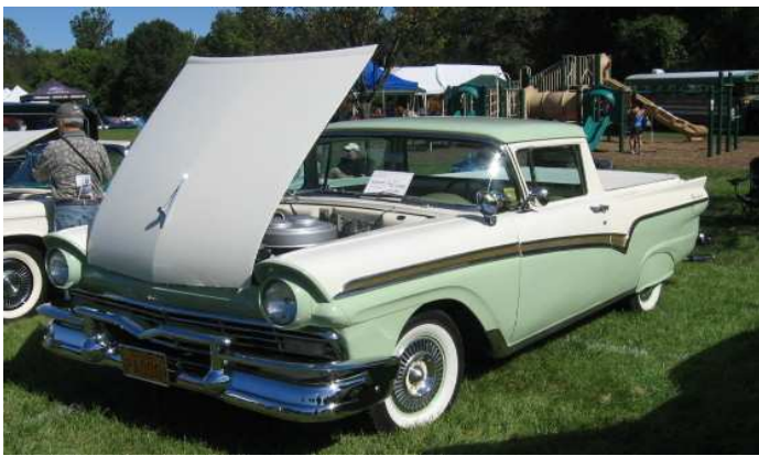
"E" 57 Ranchero with all the accessories