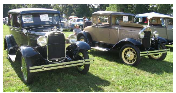
I have a soft spot for Model A's

As a lot of us know, these collars and columns seize from lack of use and they can be tough to loosen if they do.