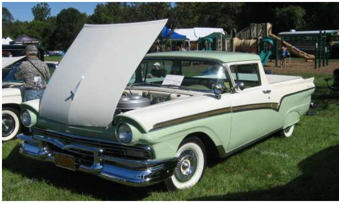
"E" 57 Ranchero with all the accessories