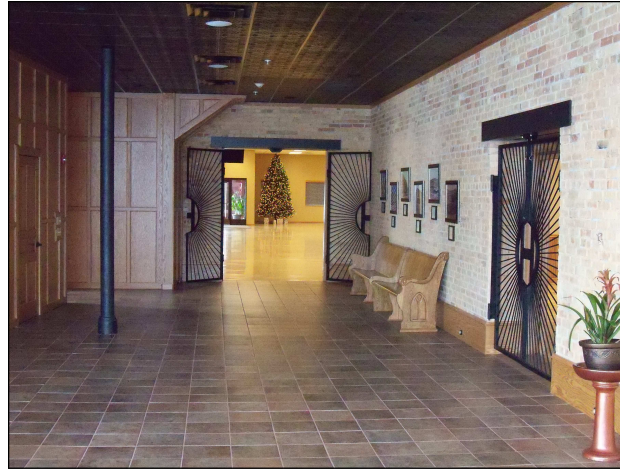
Our beautiful lobby area in the historic Hein building.