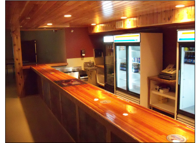
Guests are served in style at the beautifully crafted bar.