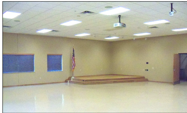
A state-of-the-art sound system carries music throughout the 4,500 square-foot main hall and into the smaller meeting room. Large, flat-panel monitors are located throughout the public areas for your enjoyment and convenience.