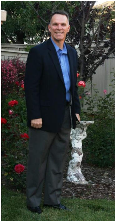
Casual: Sport Coat, Open Collar

Most popular choice; may be able to match tie to your colors on request