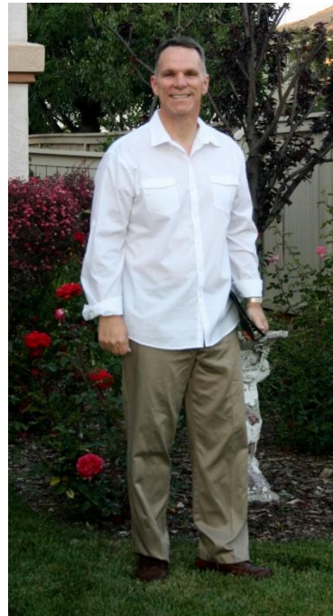
Beach: Very relaxed settings