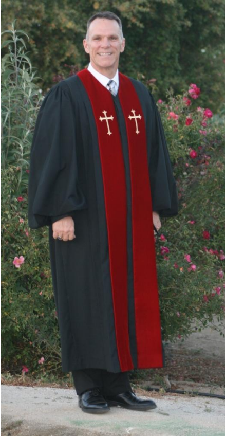
Traditional: Minister's robe