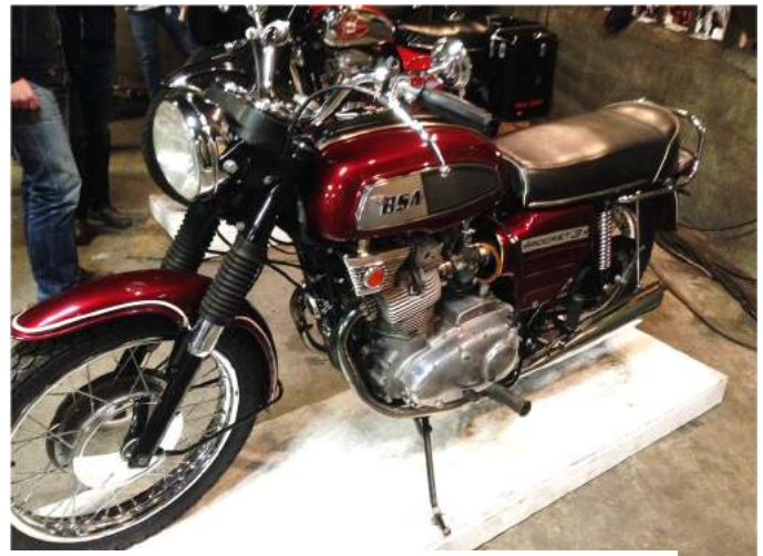
Ron Saunder's 1969 BSA Rocket 3