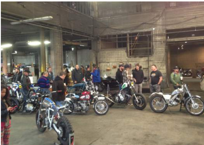
Builders line up their bikes to be photographed