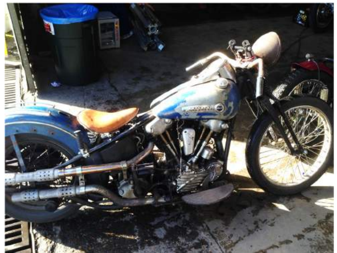
A Harley-Davidson Knuclehead bobber

Motorcycle brands included Ariel, Honda, Velocette, Triumph, Buell, Honda, Norton, Indian, Husqvarna, Saracen, Alta, Bultaco, Cappa Montesa, Maico, Vespa, Suzuki, Hodoka, Yamaha, Harley-Davidson, Indian, Moto Guzzi, Kawasaki, BSA, BMW, Ducati, and Flying Merkel. We have a copy of the working list of registered bikes, and easily half of them qualify as antiques. Besides OTC, OVM and the Mount Scott club also had bikes on display.