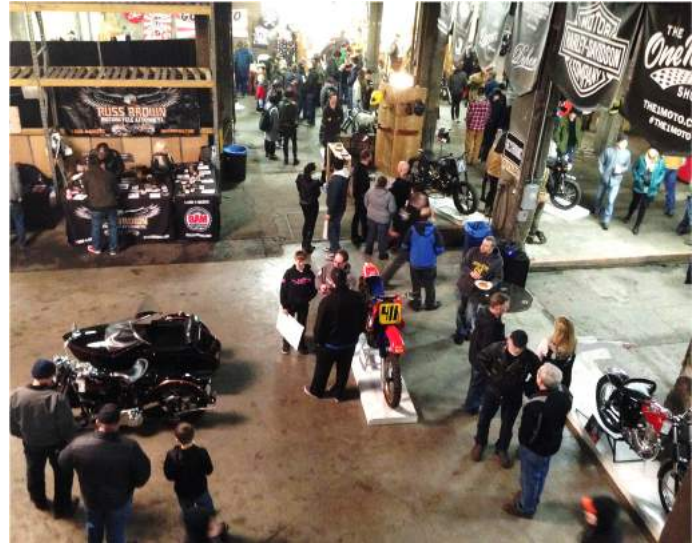
View of main entrance to the One Moto Show