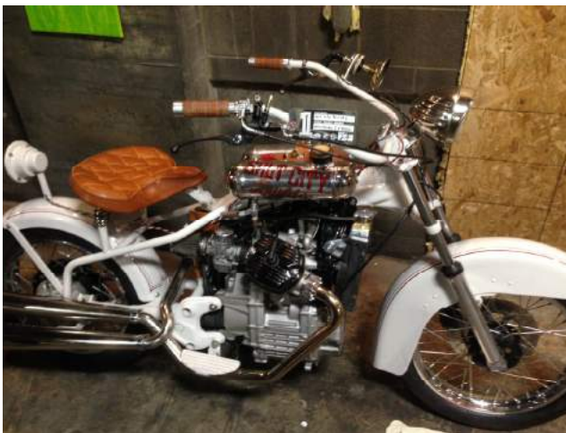
Salt City Builds 1979 Honda CX500