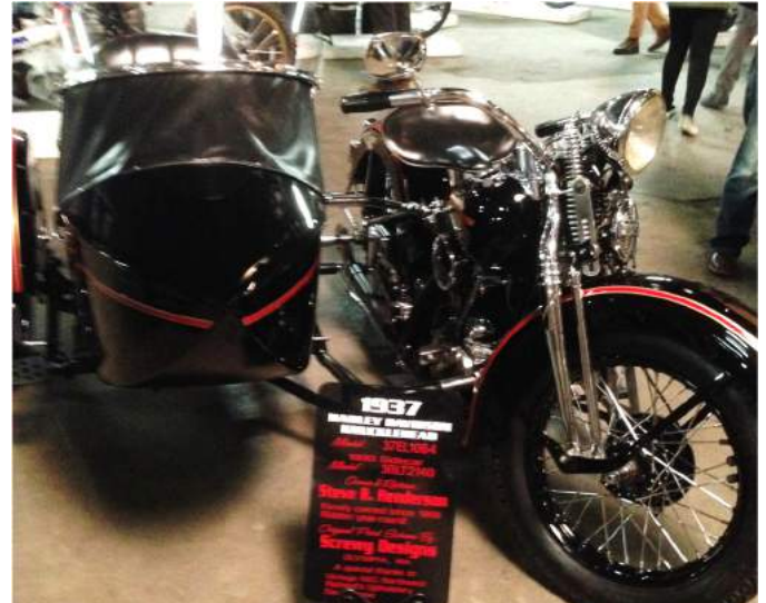
1937 HD with sidecar on the main floor

Once the bikes were placed, and the art and vendors set up, the old foundry was transformed into a Moto-art gallery. The bikes were placed on raised white platforms and spread in different wings and floors of the building. There were over 15,000 attendees viewing the approximately 180 motorcycles. I understand from people who attended that the line to enter moved quickly. The feeling of the event was very upbeat and even with all the participants, it did not feel crowded. At the display of OTC bikes, members took shifts through the three days of the show. We had seventeen individuals sign up for information about the club !