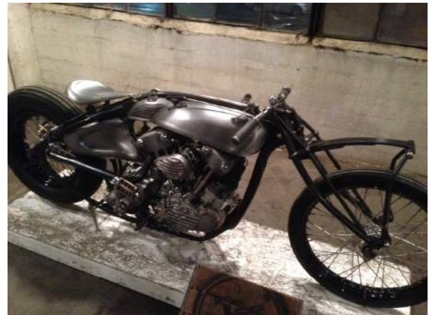
Another Harley-Davidson Knuclehead bobber