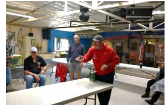
How many whiffle balls can you get in a cup in 1 minute?