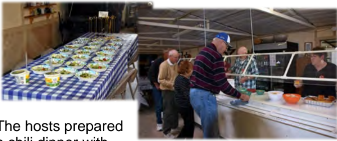
The hosts prepared a chili dinner with cornbread, salad and brownies.