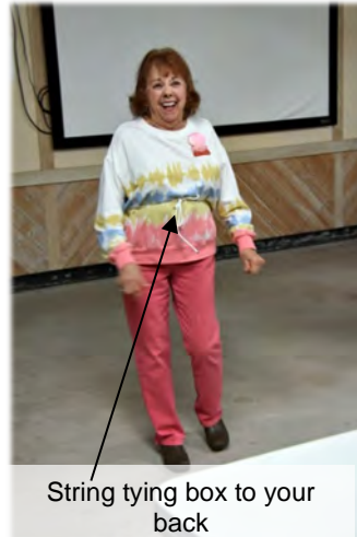
String tying box to your back