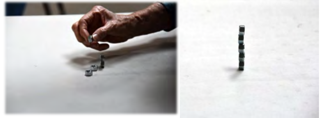
tried to stack 5 nuts (like in nuts and bolts) on top of each other in less than a minute?