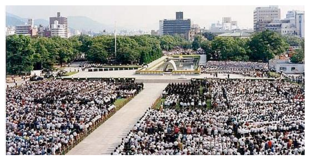
The annual August 6 ceremony in memory of those who died and have suffered from the 1945 atomic bombing of Hiroshima.

Government-to-government consultations are currently under way between the Japanese and South Korean governments. These include jointly inspecting sites in Japan where Korean conscript remains reside and extending the systematic return of remains to South Korea that began in January 2008; convening conferences concerning the Financial Deposits Names List of Korean conscripts' unpaid wages and national pension contributions, currently held by the Bank of Japan; and Japanese government partial funding of pilgrimage-style visits by Korean family members to former South Pacific battlefields where conscripted relatives were killed, which continues previous Japanese government cooperation with returning remains.[20]