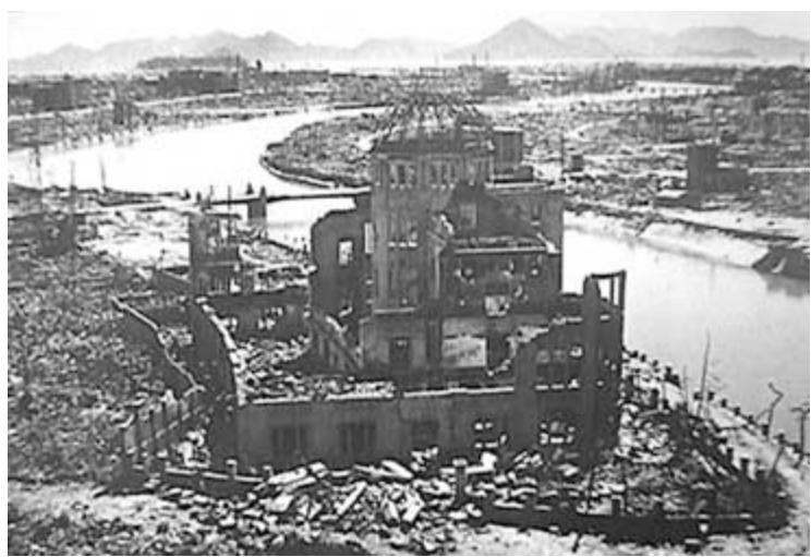
Hiroshima's atomic dome and vicinity after the atomic bombing