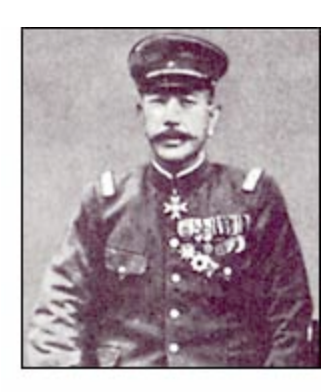
Gen. Ishii Shiro led Unit 731, Japan's chemical warfare operation in China during World War II. Ishii and those associated with him provided the U.S. with information about their experiments in exchange for immunity.

The failure of "transitional justice" at the Tokyo trials was further exposed in 2007 with the release of thousands of CIA documents by the National Archives that prove that some of the worst offenders in the Japanese military system were never tried, but in fact worked for U.S. military intelligence directed by the Supreme Allied Commander General Douglas MacArthur's immediate aide and chief of counterintelligence, General Charles Willoughby. This use of former Japanese military officers not brought to trial was part of the American Cold War campaign to contain "communism" in Asia. These ex-officers had ties to Japan's organized crime network and – according to documents of CIA agents who secretly observed U.S. military intelligence – diverted American government money into a range of fraudulent activities while in the pay of Willoughby's group.[19]