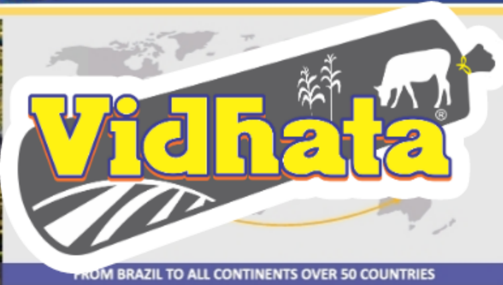
FROM BRAZIL TO ALL CONTINENTS OVER 50 COUNTRIES