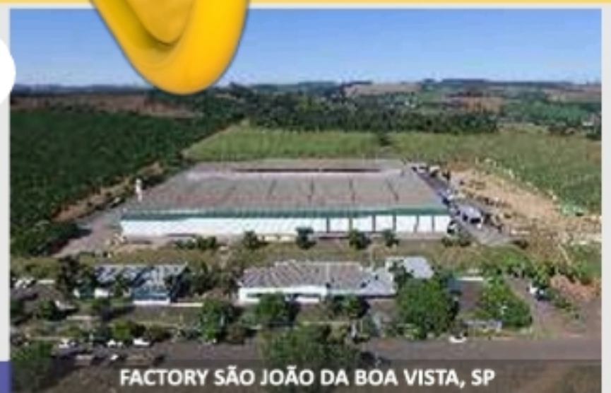
FACTORY SÃO JOÃO DA BOA VISTA, SP