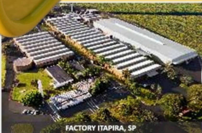
FACTORY ITAPIRA, SP