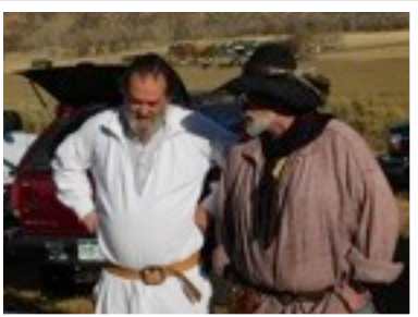
SMOKIN' TOES & MM