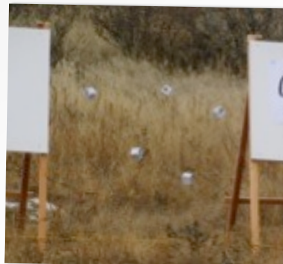
SMALL MOVING TARGETS