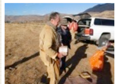
GUTSHOT AND HIS PRIZE