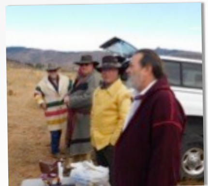
SHOOT HOST: SMOKIN' TOES