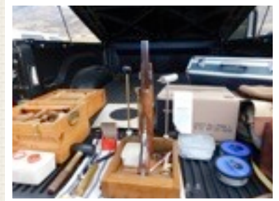
TWO EAGLES ORGANIZATION