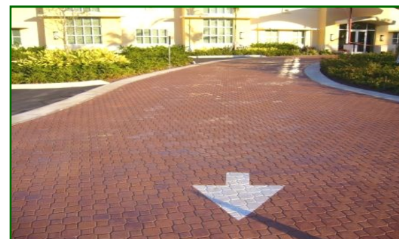
Paver Stone Restoration

The Environmentally Safe and Effective way... When Pressure Washing isn't Enough!