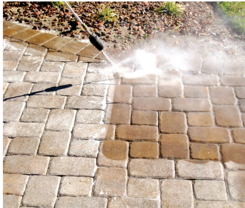
Architectural Paver Stone Cleaning

Our Restore USA products and application techniques remove stains like efflorescence (calcium/lime deposits) all types of oils, grease, tire marks, fertilizer stains, irrigation & rust stains, battery acid stains & algae mildew and mold.