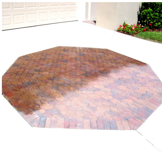
Before & After Paver Stone Restoration