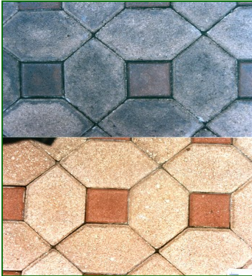
Architectural Paver Stone Restoration

Restore, Re-sand, Seal, Color Stain, and minor repairs to maintain the appearance of paver stone surfaces.