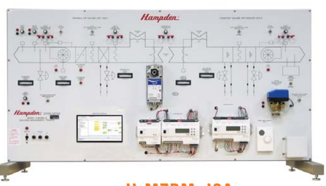
Hampden H-MZBM-J2A Multi-Zone Building Energy Management Trainer with state-of-the-art JOHNSON CONTROLS

Hampden H-MZBM-T1C Multi-Zone Building Energy Management Trainer with state-of-the-art HONEYWELL CONTROLS