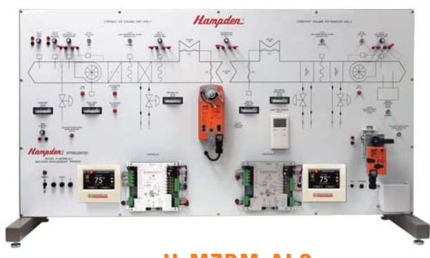
Hampden H-MZBM-AL2 Multi-Zone Building Energy Management Trainer state-of-the-art AUTOMATED LOGIC CONTROLS