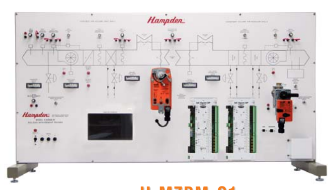
Hampden H-MZBM-C1 Multi-Zone Building Energy Management Trainer state-of-the-art CARRIER CONTROLS