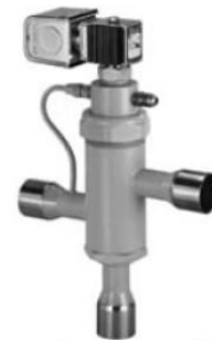
Heat Recovery Valve