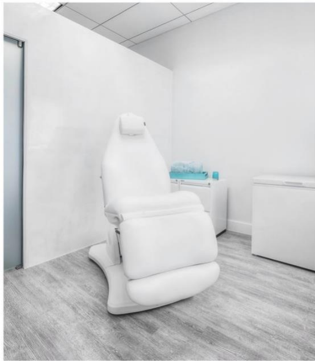
Beauty | Hot Now | LABB Aesthetic Beauty Bar