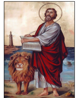
Feast Day: April 25

Mark fulfilled in his life what every Christian is called to do: proclaim to all people the Good News that is the source of salvation. In particular, Mark's way was by writing. His symbol is the winged lion symbol because according to ancient legend, while taking refuge from a storm in the city of Venice, Mark was visited in a dream by an angel in the form of a winged lion. He is the patron saint of notaries and Venice.