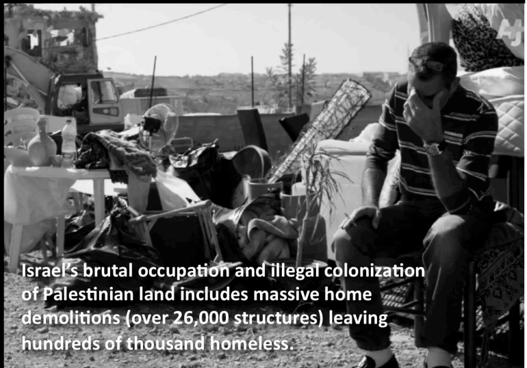
Israel's brutal occupation and illegal colonization of Palestinian land includes massive home demolitions (over 26,000 structures) leaving hundreds of thousand homeless.