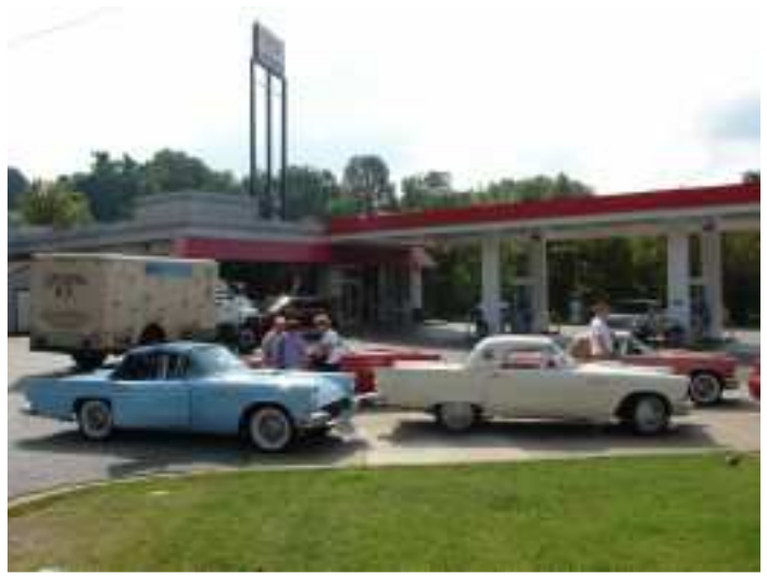
One of many gas/bathroom stops