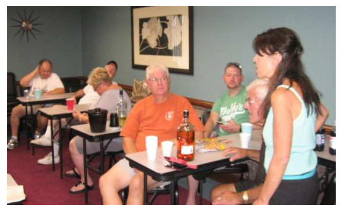
1st night's stop