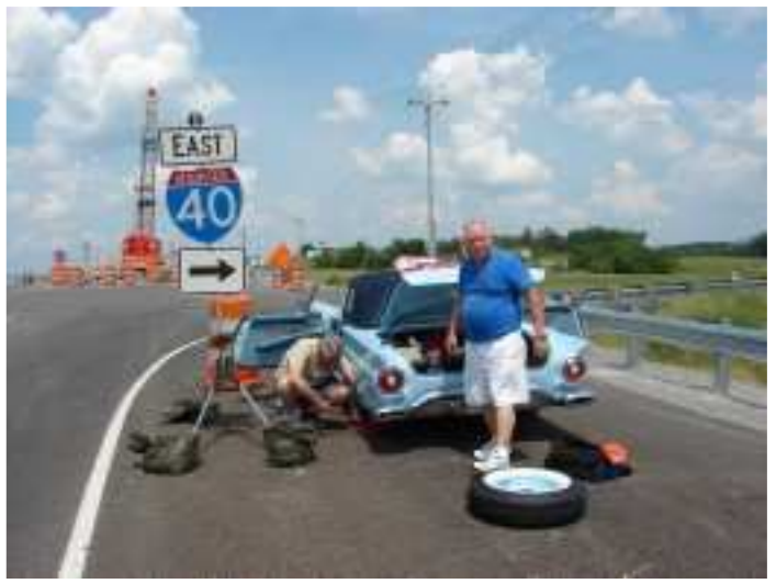
What? Me get my hands dirty -I'm the Pres Miscellaneous