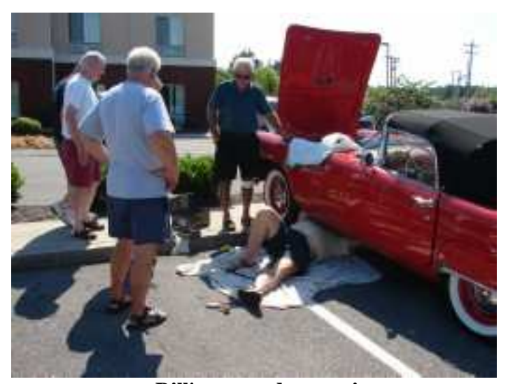
Bill's car under repair