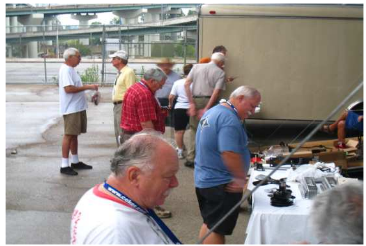
Ok - which is the real Pat - Cloning gone too far?