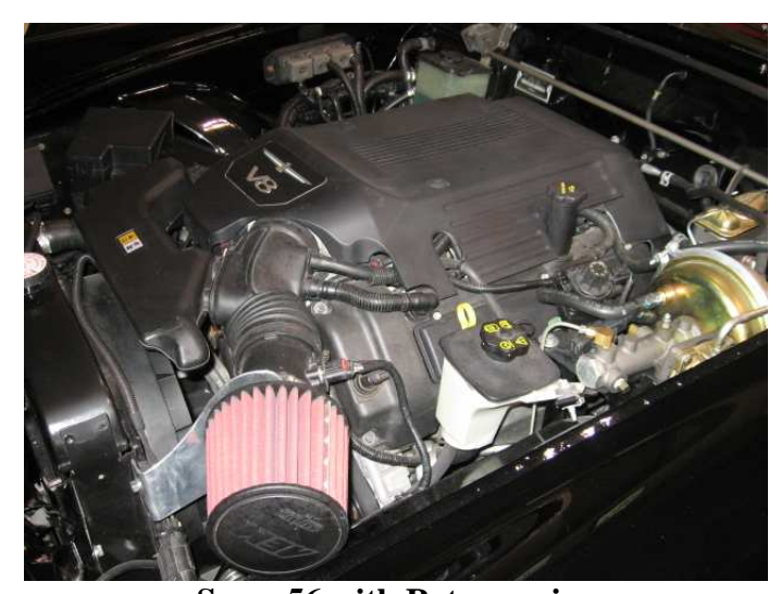
Same 56 with Retro engine

Hemmings Blog had a article about Memphis- one of their photos had our cars in it. Go to <a href="http://blog.hemmings.com/">http://blog.hemmings.com/</a>