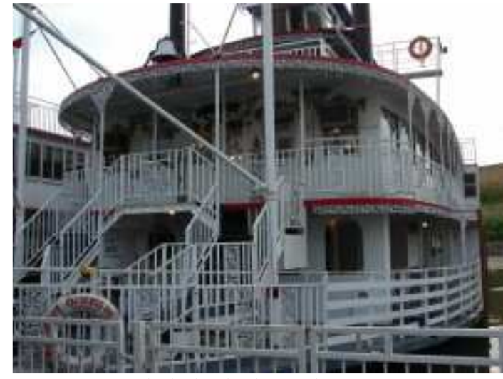
Mississippi River Riverboat