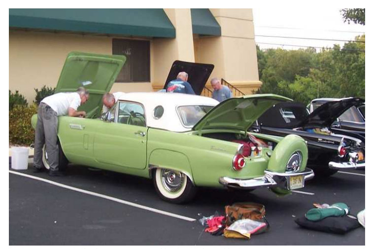
Fixing those "teething" problems