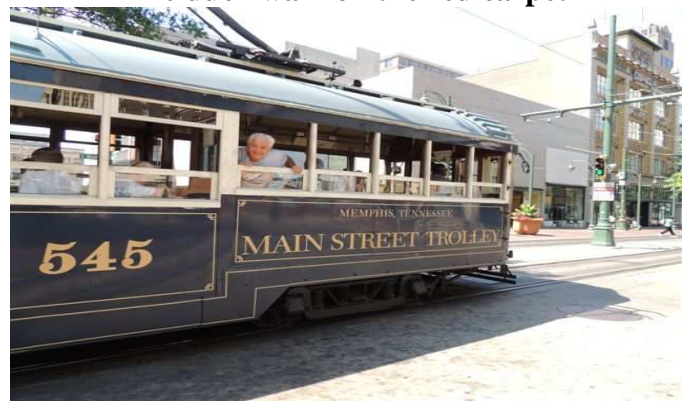
Clang, Clang Clang goes the Trolley