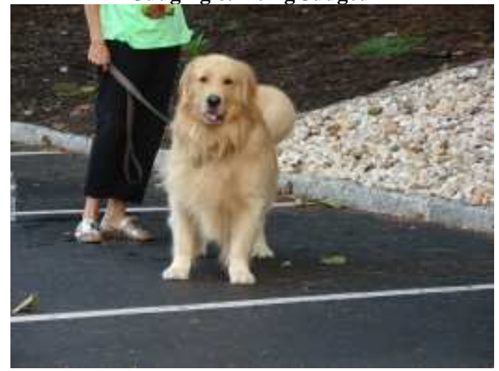
Beemer - He went to Memphis too. Very well behaved and lived in the Peabody with the ducks