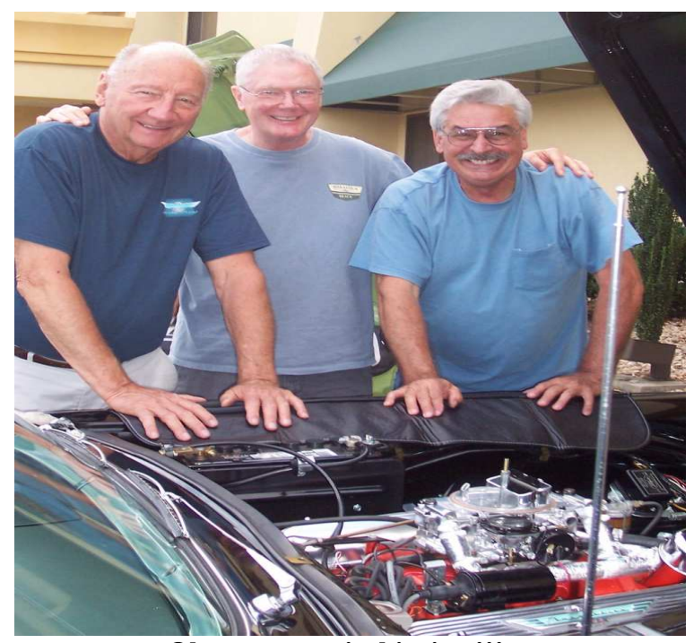
Okay - we got it this time!!!