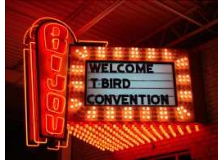
T-Bidders were very welcome in Memphis