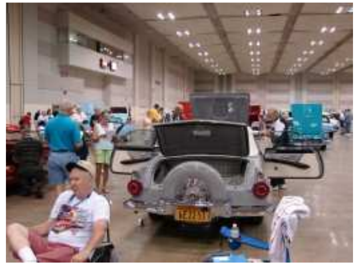
Judging & Being Judged