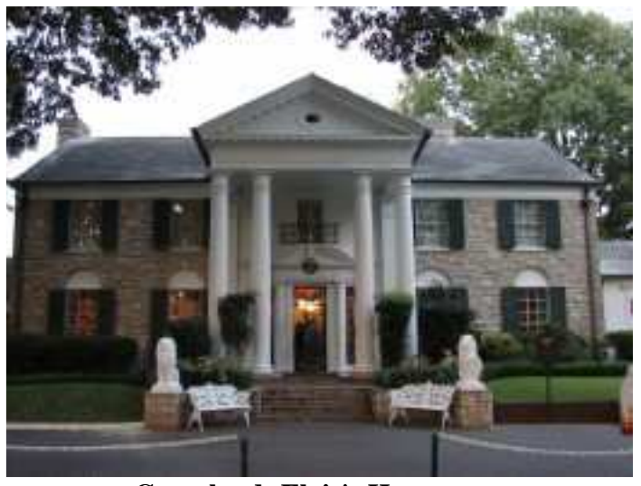
Graceland- Elvis's Home