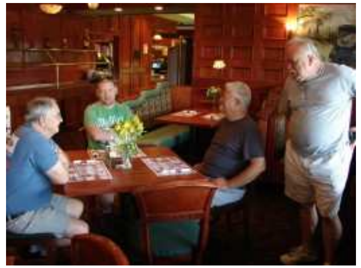
Ist day - start off point