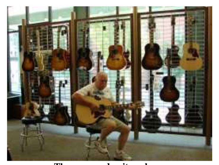
The unnamed guitar player