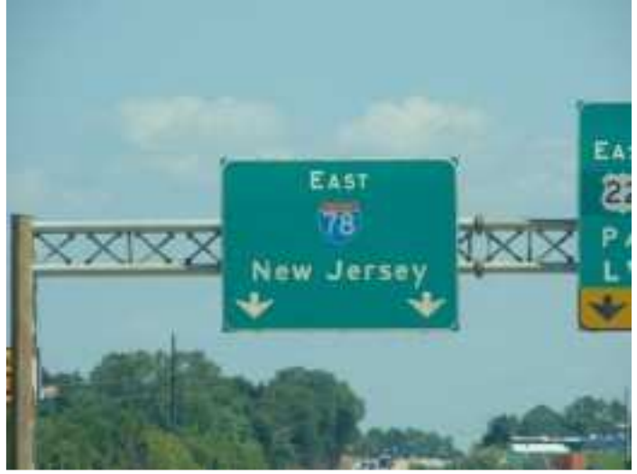
After 2,200 miles, back home