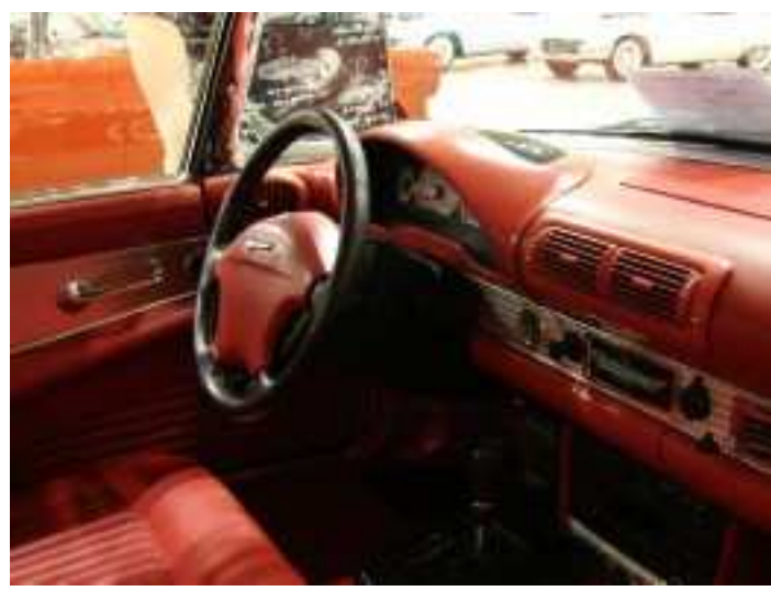
56 with retro Bird Accents