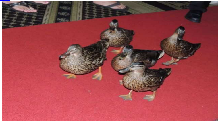
The duck walk on the red carpet

Memphis Fact In 1820, the population was 364 Today it is over 650,000