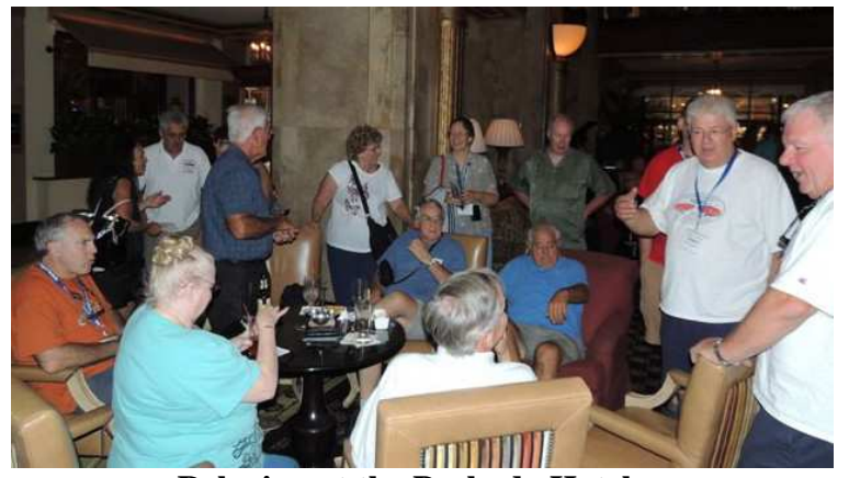
Relaxing at the Peabody Hotel

Memphis Fact In 1820, the population was 364 Today it is over 650,000