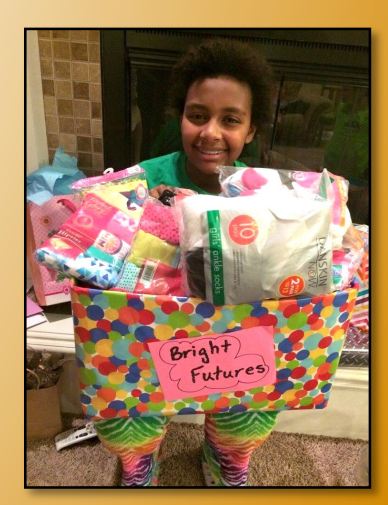
Donations in lieu of gifts at her birthday party!