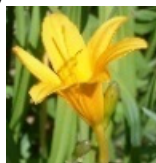
Light Orange short late