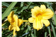
Yellow small short early