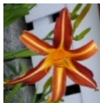
Dark red/yellow stripe