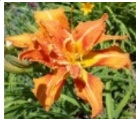
Orange double tall late