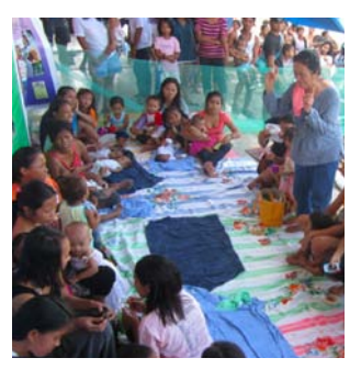
Arugaan volunteers helping mothers to breastfeed and make appropriate complementary foods.