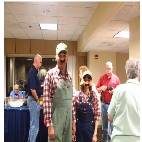
Costumes from the Halloween party in 2013.