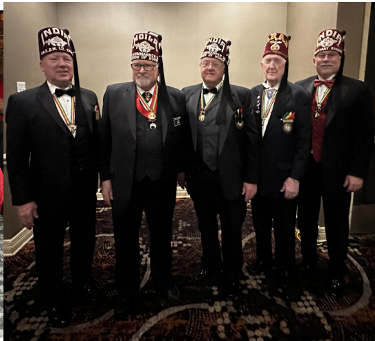
Top Left, Right, Bottom Right IALOH Officers, Chief of Staff Past International Commanders and Ladies at the TALOH Convention.