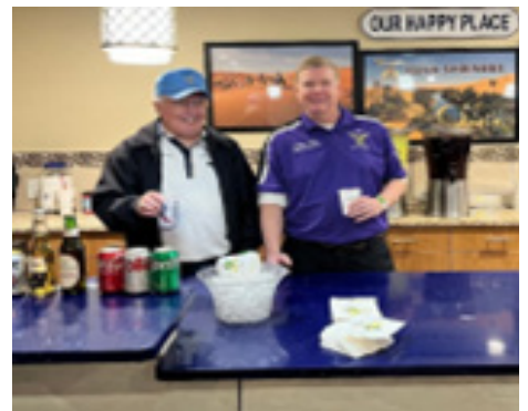
You Can Trust Your Bartender