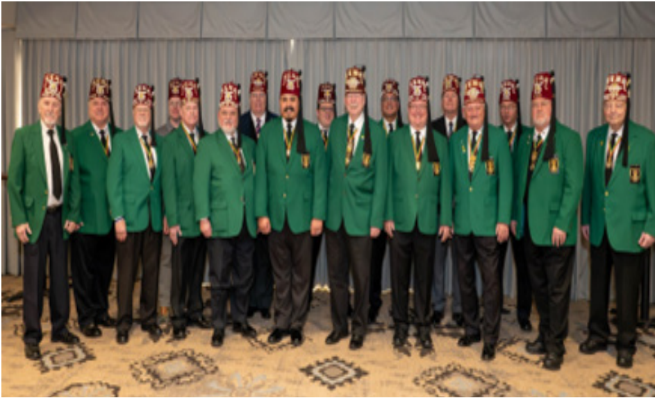
Top Left: Distinguished LOH members at Kena LOH Installation on Jan. 20