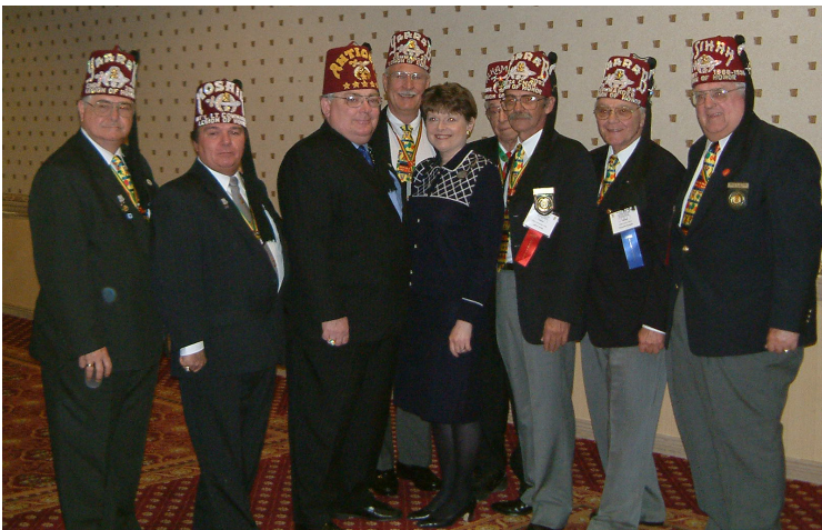
Bottom Left and Right: Blast From The Past Las Vegas