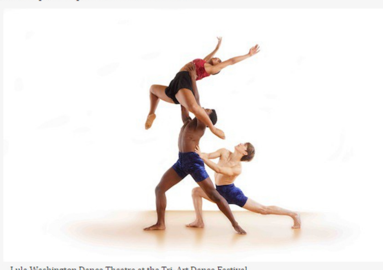
Lula Washington Dance Theatre at the Tri-Art Dance Festival

The contemporary dance company Pony Box Dance Theatre performs its Sylvia Plath-inspired Edge as part of the free A LOT festival, named for its location in the parking lot of beloved but now-closed bookstore Acres of Books and sponsored by the Art Council for Long Beach. For details on all of the events in the two-day festival, go to www.alotlongbeach.org . Acres of Books, 240 Long Beach Blvd., Long Beach; Sat., Sept. 27, 7 p.m., free with reservation.