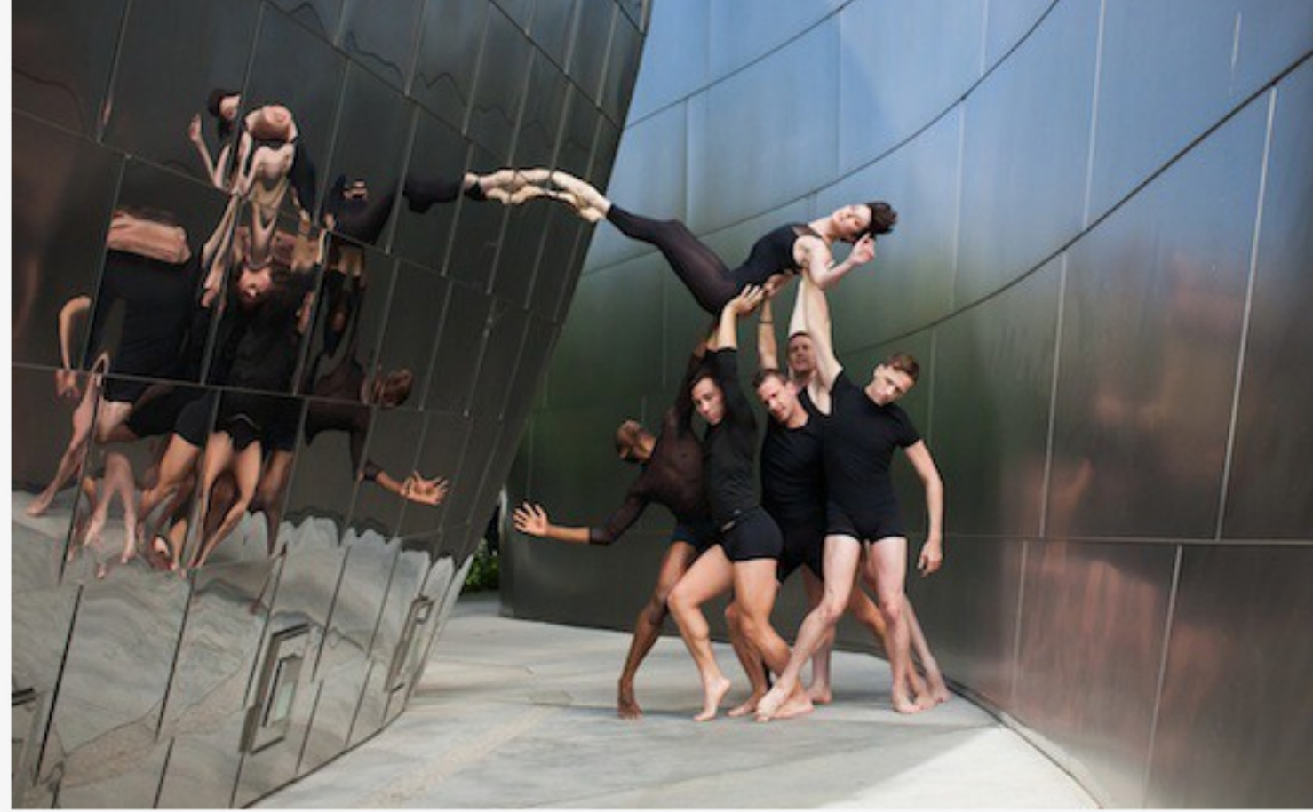
Pony Box Dance Theatre