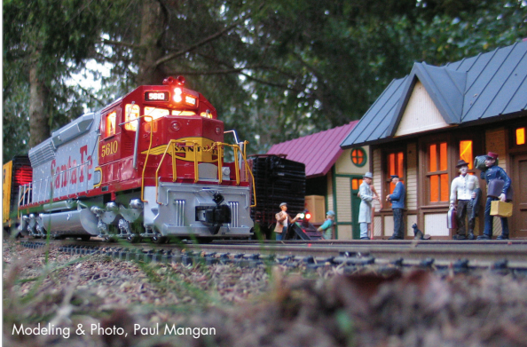
Modeling & Photo, Paul Mangan