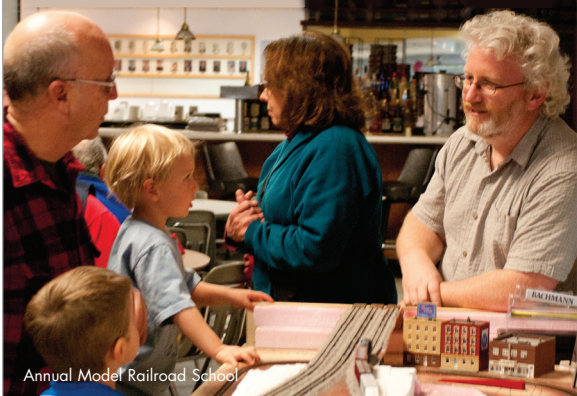
Annual Model Railroad School