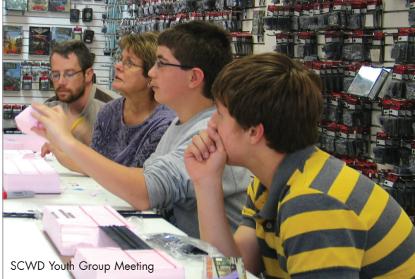
SCWD Youth Group Meeting