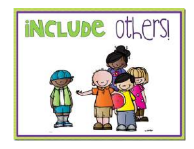
December 10 Include others