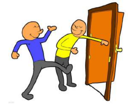
November 5 Open doors for others