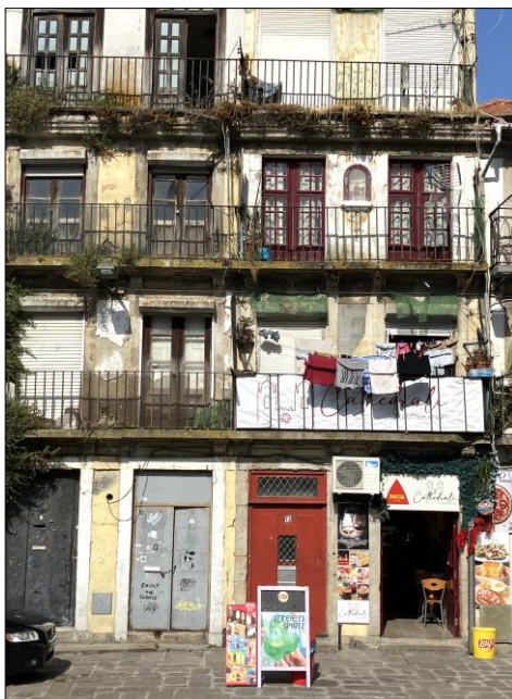
Typical housing in Porto, Portugal