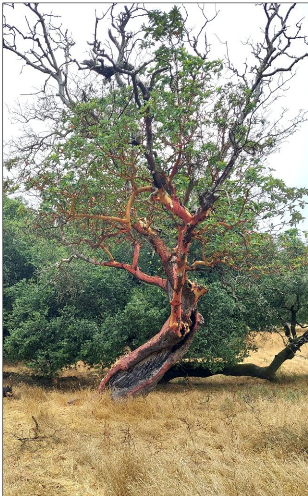
Tolay Park off Lakeville Hwy.