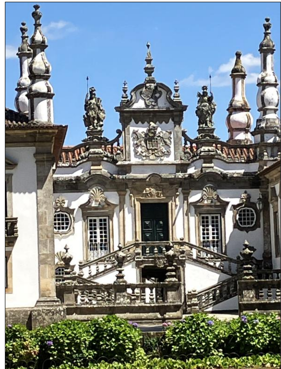
The Palace that Mateus rose wine built

We found that many of the people spoke English. Americans were warmly welcomed. The country is beautiful! The food was good and the wine and port were delicious! We heard many stories about Americans moving to Portugal. Much of Portugal, especially their vineyard areas will remind you of Sonoma. I would go back and spend more time in Lisboa and Porto. Both are beautiful cities.