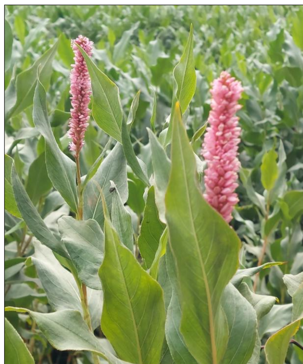
Tolay Park off Lakeville Hwy.