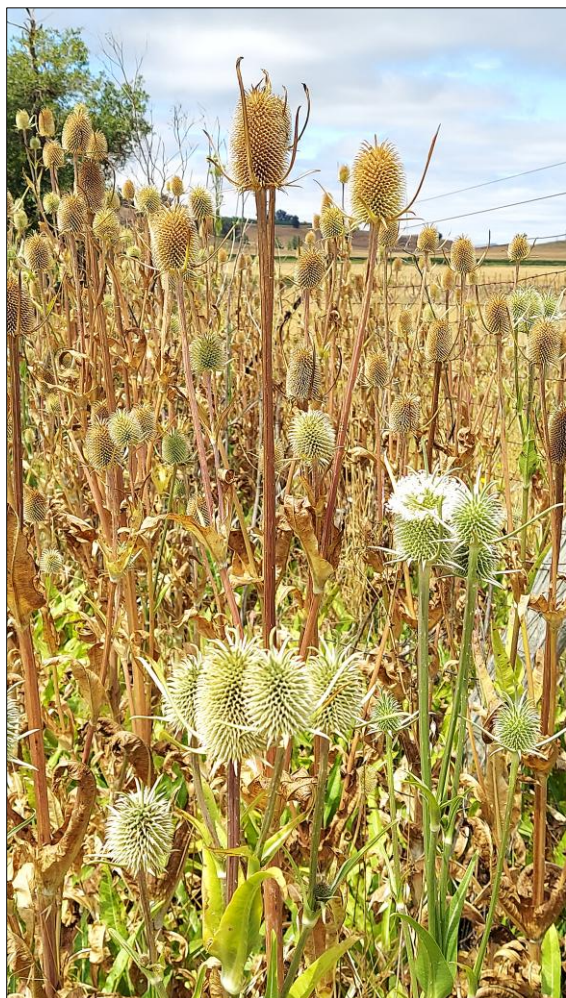
Tolay Park off Lakeville Hwy.