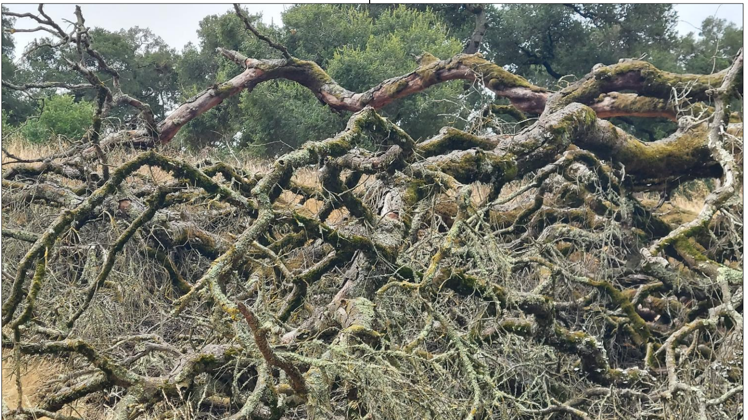
Tolay Park off Lakeville Hwy.