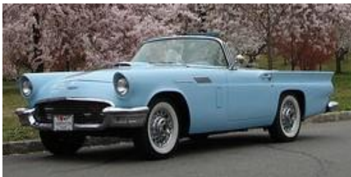
Pat LeStrange's 57