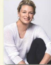
Kristin Hannah Fiction