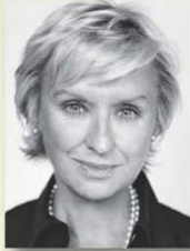
Tina Brown Nonfiction/Memoir