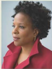
Tayari Jones Fiction