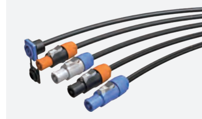
YF24 2/3/4 Pins

Product advantages:It adopts snap-type nut rotation and locking connection, which has the characteristics of fire resistance, explosion resistance, deformation resistance, cold resistance, high temperature resistance, corrosion resistance and waterproof function.