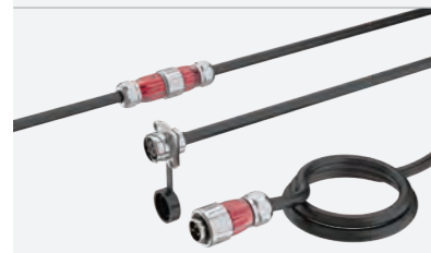
DH20 2/3/4 Pins

Product advantages:It adopts unique snap button and plug-type connection, which has the characteristics of explosion resistance, deformation resistance, cold or high temperature resistance, corrosion resistance, excellent insulation performance, and dustproof and waterproof functions.