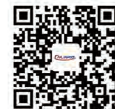
CNLINKO official website QR code for harness and connector customization area

Scan the QR code below to check the harness and connector customization area of CNLINKO official website. If you have any doubts, you can contact the online customer service for more detailed product information.