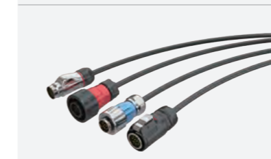
LP,DH,YM,BD (Multi-Pin 5~24 Pins)

The HDMI 2.1 wire has metal armor, the material is SUS304, which is anti-pulling and bending, preventing it from being bitten by animals and its length up to 300M.