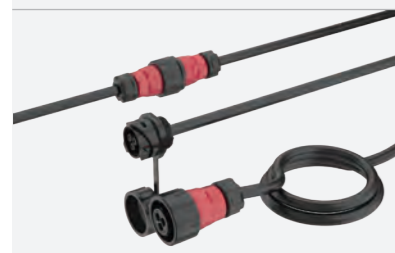
YM24 2/3/4 Pins

Product advantages:It adopts lock-type connection, which has the characteristics of cold resistance, high temperature resistance, corrosion resistance and waterproof function.