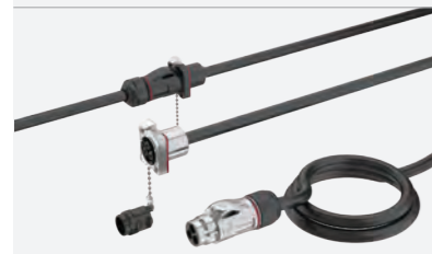
BD24 2/3/4 Pins

Product advantages:It adopts spring snap-type locking connection, which has the characteristics of cold resistance, high temperature resistance and waterproof function.