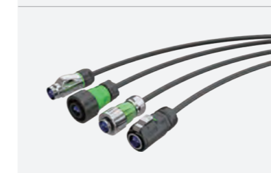
LP,DH,YM,BD (LC Optical fiber)

The wire specification meets the transmission standard of Super Category 5, which is Cat5/Cat-5e/Cat6, multi-strand copper wire is twisted, and the signal transmission is more stable.