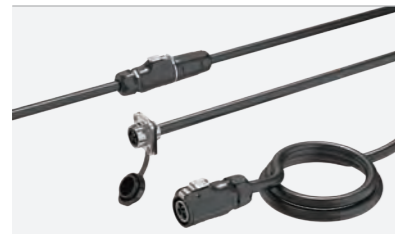
LP20 2/3/4 Pins

Application: Solar photovoltaic, new energy storage