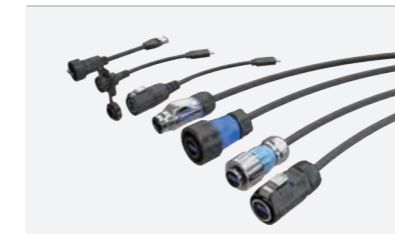
LP,DH,YM,YU,BD (USB2.0/3.0,Type-C 3.1)

Application: Communication, testing, industrial control and automation equipment, photographic equipment