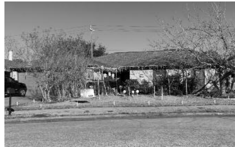
Additional winner - 12710 Newberry St.