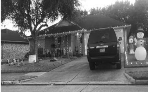
Section 1 - 12823 Newberry St.