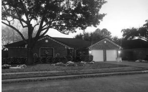
Section 2 - 2402 Manorwood St.