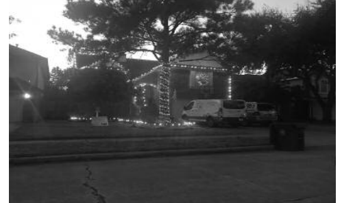
Section 3 - 2019 Summerfield Place