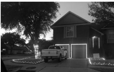
Section 3 - 12823 Waybridge