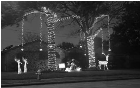
Section 4 - 13118 Nantucket Dr.