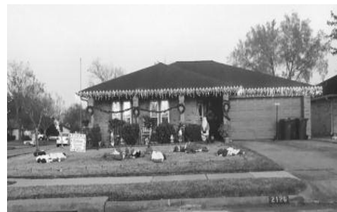
Section 2 - 2126 Endicott