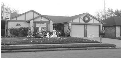
Section 1 - 2118 Barrington Place