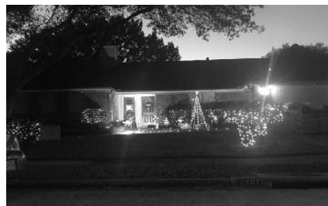
Section 4/5 - 2407 Collingsfield