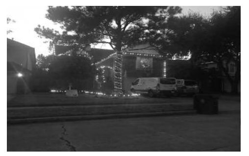
Section 3 - 2019 Summerfield Place