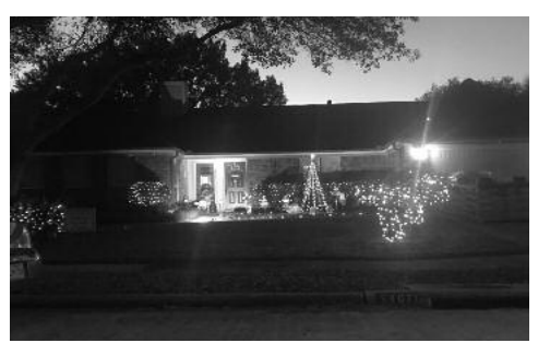
Section 4/5 - 2407 Collingsfield