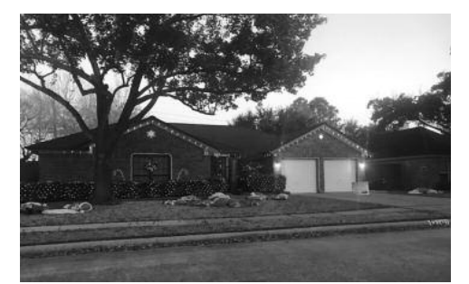
Section 2 - 2402 Manorwood St.