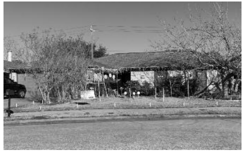
Additional winner - 12710 Newberry St.