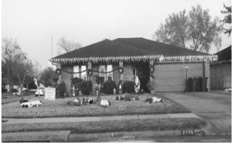
Section 2 - 2126 Endicott