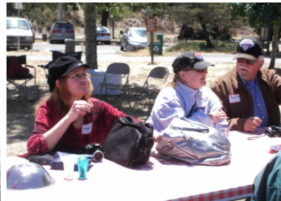
Start making plans to come next year.