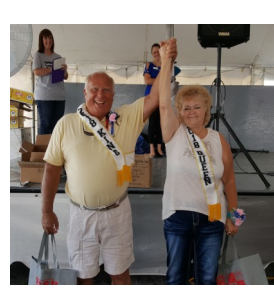
Senior Day at the Fair - Mark your calendar -Tuesday, August 13 at the Mercer County Fair.