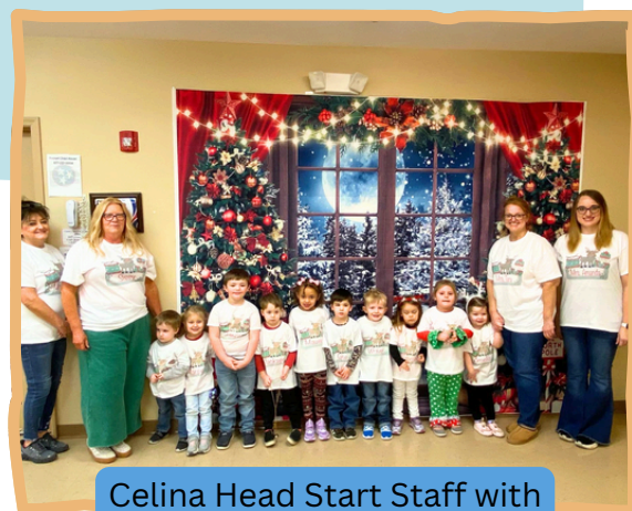
Celina Head Start Staff with Class A

These conversations help children understand that their actions matter.