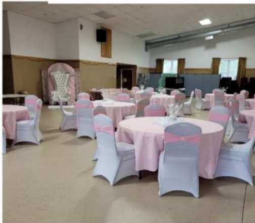
Sweet 16 Party