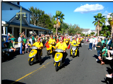
Yellow Jackets on the street.

JANUARY: Monthly Luncheon Meeting .....22nd Meetings held at Perkins on Hwy 466 the 4th Thursday of every month at 11:30 am.