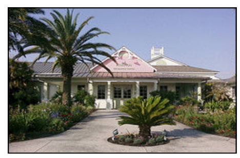
MEETING PLACE OF THE VILLAGES SHRINE CLUB Hibiscus Recreation Center 1740 Bailey Trail, The Villages, FL