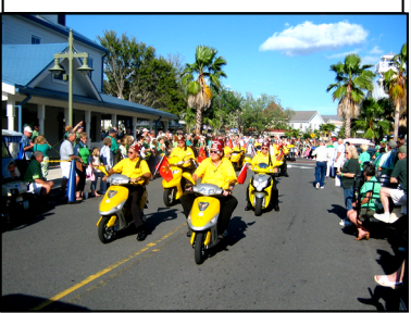
Yellow Jackets on the street.

Monthly Luncheon Meeting ........22nd Meetings held at Perkins on Hwy 466 the 4th Thursday of every month at 11:30 am.