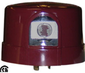
Photo Controls and Timers Pre- paid 60 piece order

FOR OVER 50 YEARS PRECISION THE #1 SOURCE FOR ENERGY SAVINGS CONTROLS