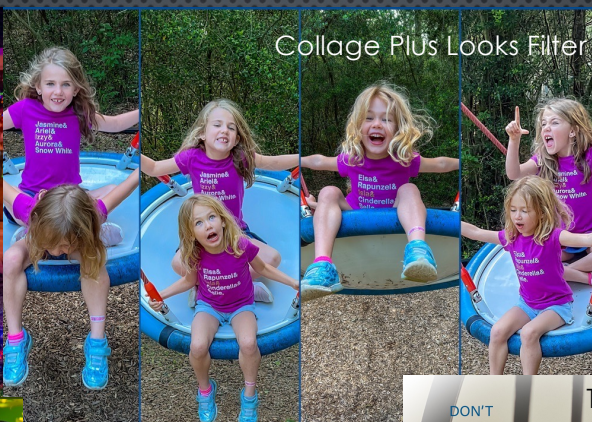
Now gimme that pink slipper!