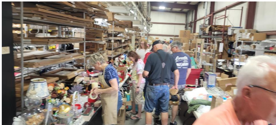
Yard Sale Pricing