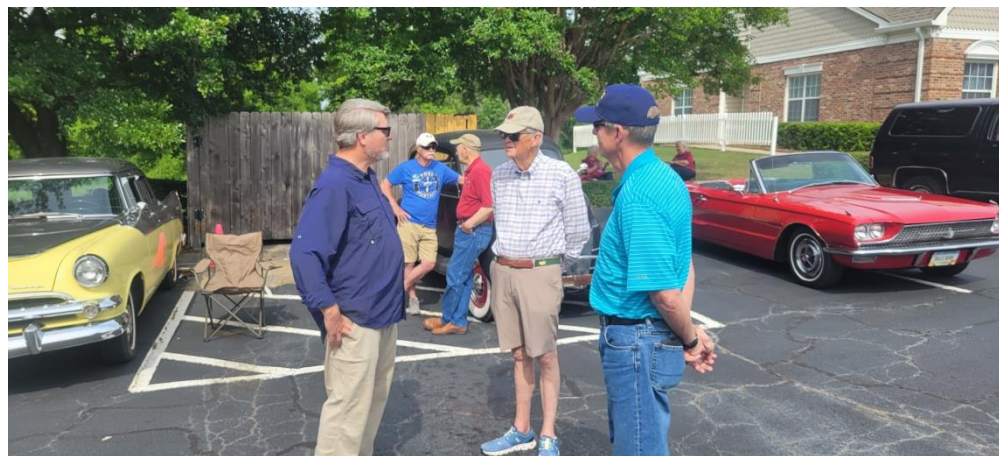
Oaks Senior Living