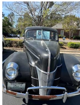
Jim's 40 Ford