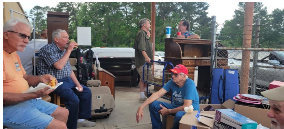
Yard Sale Break