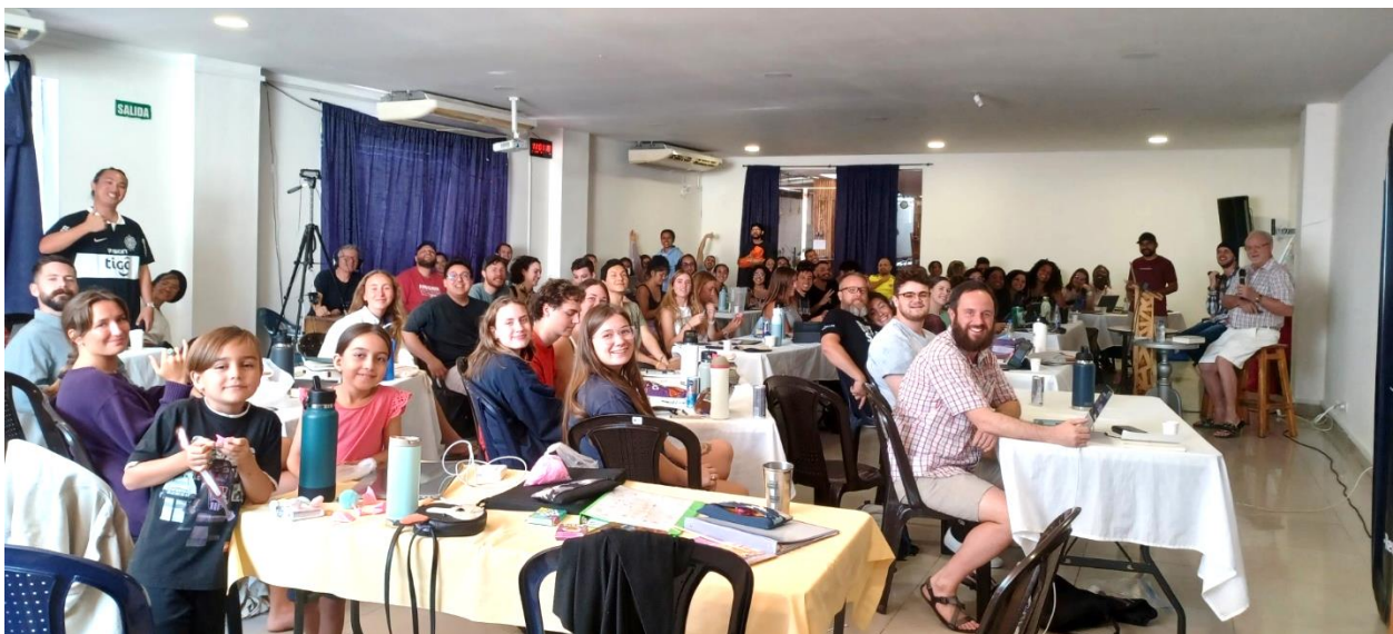
Here is my class of 70+ teachers (and a couple of young kids on the left), most from Latin America, but also several from Europe and America.

Our next place of service was in Cartagena, Colombia, where I was scheduled to teach in a Bible Teachers School for two weeks. We left Detroit in a raging blizzard and near zero temperatures, arriving in South America to about 100 degrees hotter temps. This would be the second of three annual seminars for teachers of the Bible. I did a BTS I last year in Mexico, and in Colombia I taught BTS II in Cartagena. About 75 teachers from 18 nations made up my class, most from the various countries in South America, but also a handful from Europe and North America. All lectures were translated into Spanish, and we had a Portuguese