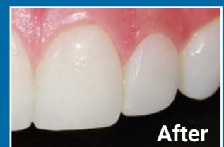
Dr Hugh Flax (USA)