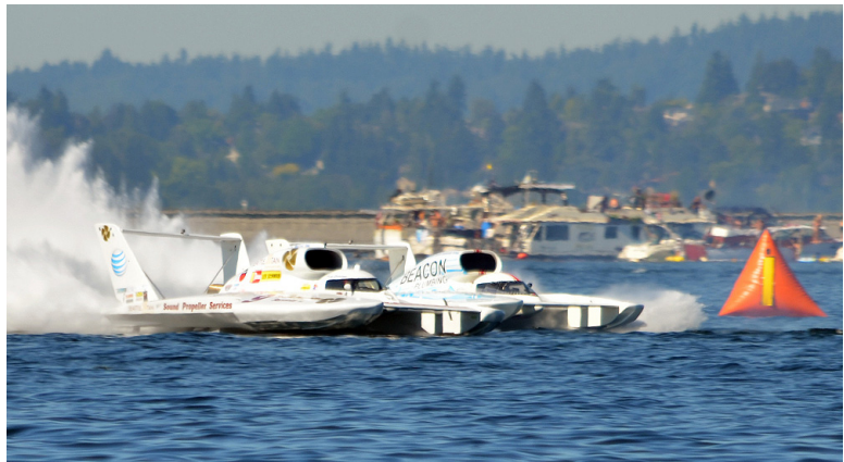
Karl Pearson photo