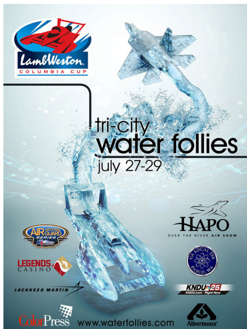
2012 Tri-Cities Water Follies Poster