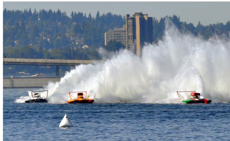
Karl Pearson photo