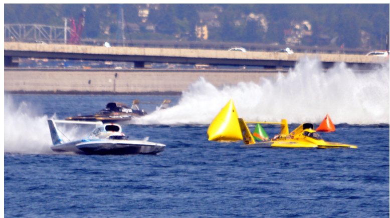
Karl Pearson photo