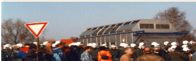
German protests against nuclear waste shipments to Gorleben.

The nuclear industry in Canada is fond of describing what it calls an "international consensus" around nuclear waste. The consensus, they claim, is that the best option for the long term management of nuclear waste is to "dispose" of it by burying it deep underground. But where is that happening? Nowhere! Finland has plans to do so, but is still investigating a potential site. Sweden says they are going to do it, and has a location and a plan, but the environmental assessment process stalled in 2012 when the proposal was returned to the company for additional work, and again in 2018. Germany has put plans on hold and is now talking "storage". The U.S. cancelled plans to bury high level waste in Nevada, and have started over, with plans to set up a new organization to search for a "storage" site. A new plan was announced early in 2010 for 'shallow storage' in Scotland, but a site has not been identified and certainly has not been accepted. And, in Canada, the nuclear industry has an "idea", but no design, and certainly no location.