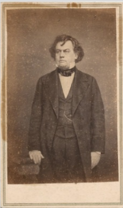
Robert Toombs (1810-1885)

In all, twenty-five U.S. Senators will exit their seats, all Southerners except for Jesse Bright of Indiana, a so-called Copperhead Democrat opposed to possible warfare. Bright has been three times President Pro Tempore of the chamber, and is expelled on February 5, 1861, for officially acknowledging Jefferson Davis as President of the Confederacy and for accusations that he helped direct arms to the Southern cause. No other senator has been expelled since Bright, as on 2108.