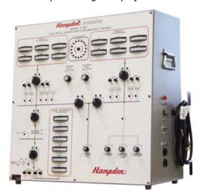
Hampden MODEL H-188-1

Electrical Generation Fundamentals Trainer