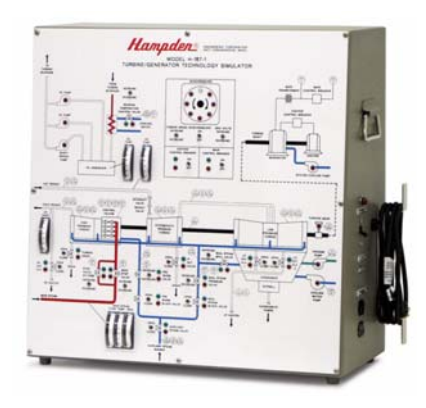
MODEL H-187-1 Turbine/Generator Technology Simulator