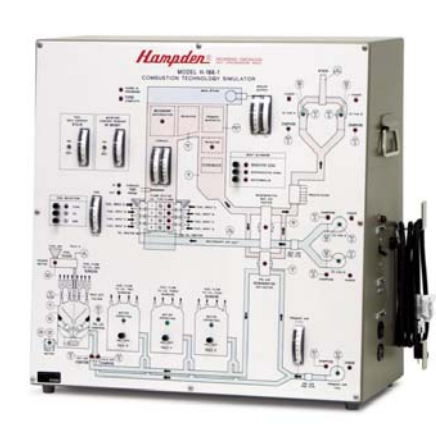
MODEL H-186-1 Combustion Technology Simulator