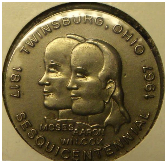
1967 Sesquicentennial Coin