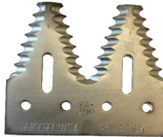
JD (600 SERIES) 8531SK2 $ 2.30 EA.