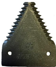
MAC DON 4398SK2 $ 1.10 EA.