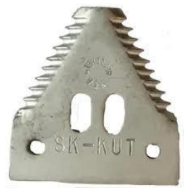
SCH 4498SK2 $ 1.50 EA.