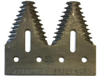
JD (600 SER.) 9531SK2 (BLACK) $ 2.00 EA.