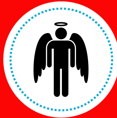
Rebellion by Angels Genesis 6:1-6

God responded by removing man from the Garden of Eden.